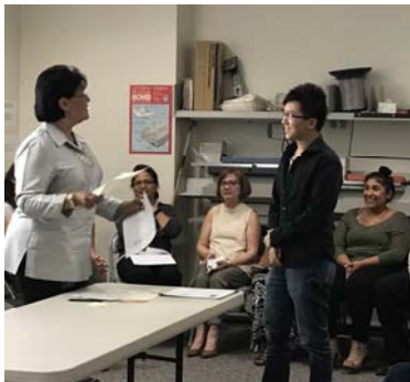
The Treasurer-Tax Collector-Revenue Services Way to Go! Awards and potluck lunch were held on July 11 th .